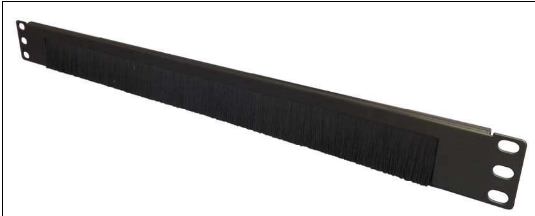
1U Open Brush Strip Panel (MBrushBK)

The brush strip panels enable the installer to organise the cabinet while minimising disruption of airflow. Unlike letterbox-style brush panels, our single sided panels offer the advantage that one item can be used for both a small or (by using 2 pieces, one inverted) a large opening.