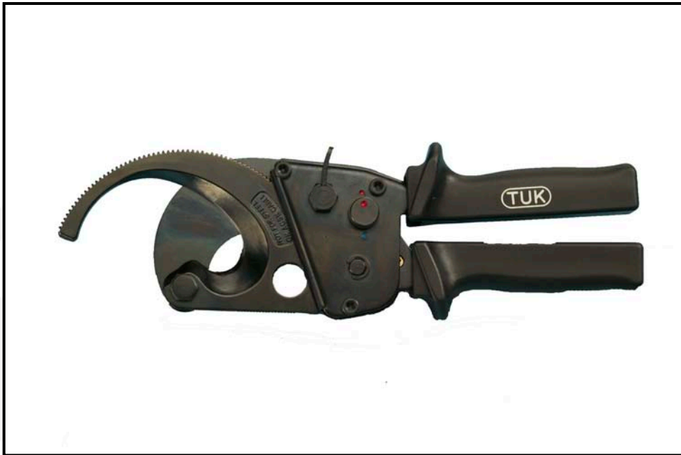
Ratchet Cable Cutter (T2061)