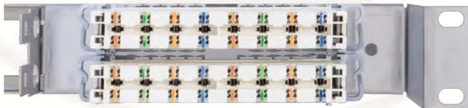
Example of sub-rack mounting