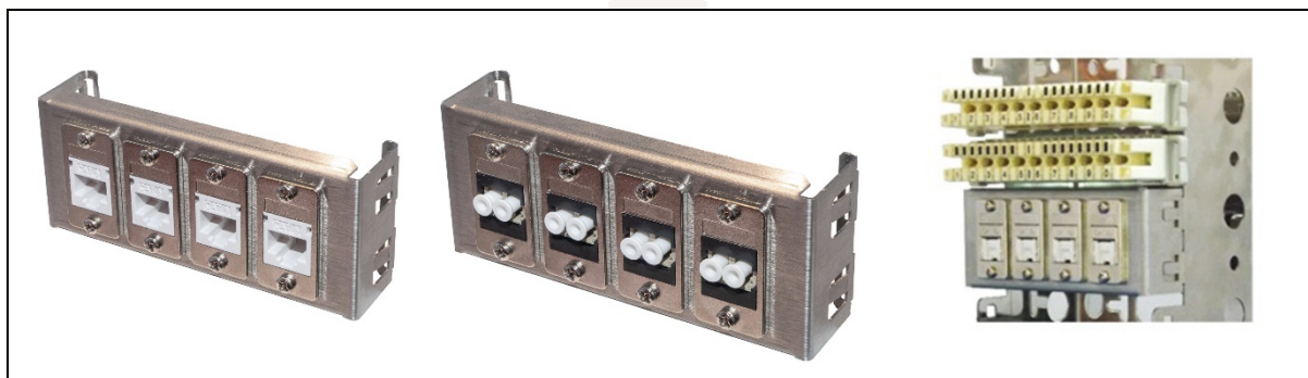
Illustrative shots of MF4PM in use